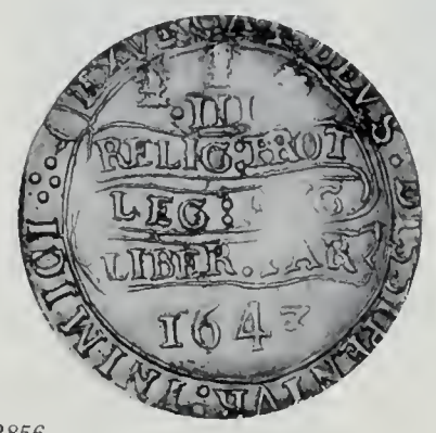
Lot No. 2856

2856 Oxford Triple Unite, 1643. mm Plume. Obv. Crowned half-length figure holding sword and olive branch, plumes behind in field, without floating scarf. Inscription, CAROLVS D.G. MAGN. BRIT. FRAN ET HIB. REX. Rv. Declaration in a continuous scroll with III above. 26.91 Grams. S.2727, North 2384. There is a small area of weakness affecting the ANG and PAR on the reverse. Basically there is little wear. The piece is a fully round well balanced example of one of the handsomest of English Gold Coins. Extremely Fine. (SEE COLOR PLATE) (12,500-15,000)